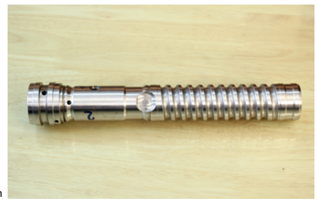
The Primo system helps in setting the steering worm shaft accurately for slot milling on a vertical machining centre

Prior to installation of the Primo system at SuMax, tool pre-setting operations had to be carried out off-line in a tool crib by a skilled engineer. The operator would have to remove