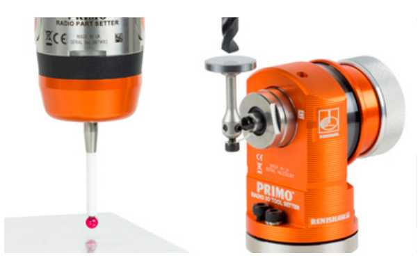
The Primo™ system, including Radio Part Setter and Radio 3D Tool Setter

Using a Primo system has helped SuMax to increase machine utilisation time, eliminate scrap and reduce the time consuming tool setting process. SuMax was attracted to the Primo system's 'pay-as-you-probe' concept with a low initial investment and a unique credit token system. Moreover, the Primo Total Protect cover provides complete peace of mind and safeguards the Primo system against any accidental damage by providing a comprehensive warranty.