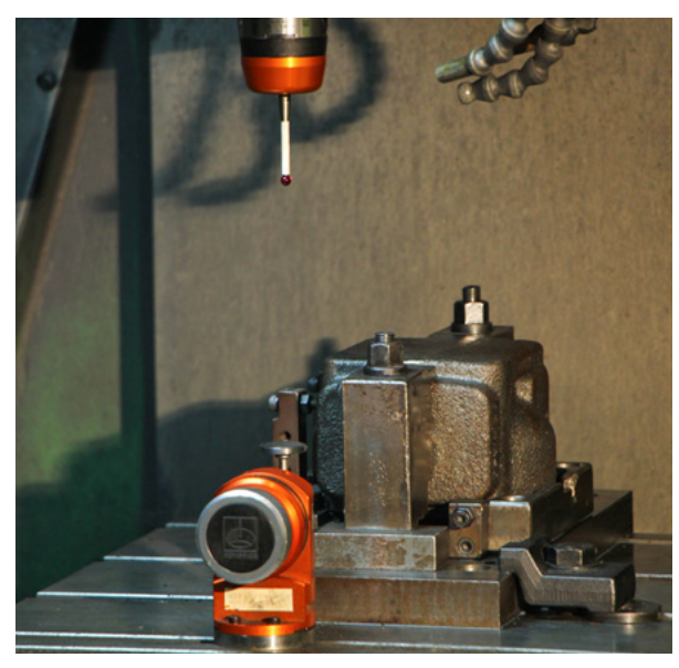
Pump body casting being probed for wall thickness variation with the Primo system

"This entire process is eliminated by the Primo tool setter as now the operator has to just call a code and assign the tool to the code. Through a simple one-line program, the tool is called from the magazine to the spindle, the spindle then goes above the tool setter, travels down at a particular speed, touches the pre-setter probe and measures the offset. This process is carried out twice. In this process, all setting is done by the machine and the operator has to just change the insert on the tool. This saves lot of time and no additional investment is required like the material handling cost, manpower cost etc," said Mr Suttatti.