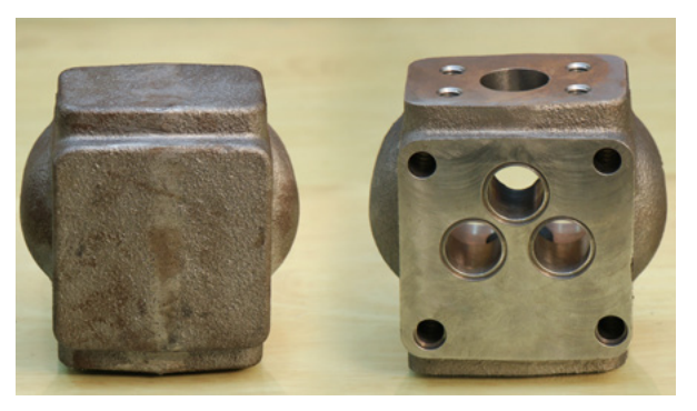
Pump body casting before and after machining

The Primo system was installed on a machine used for the precision machining of pump body castings and steering worm shafts. In the case of the pump body casting, establishing a datum edge accurately to avoid wall thickness variation was